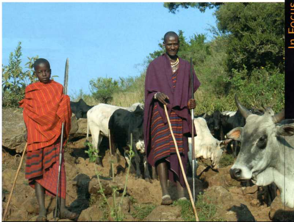
Cattle herded into the crater for water and natural salt licks can create erosion problems on its steep rim.

The NCA came into existence in 1959 under an agreement between the Maasai elders and the Tanzanian Government 'to conserve and develop the natural resources of the conservation area' and 'to safeguard and promote the interests of the Maasai citizens of the United Republic engaged in