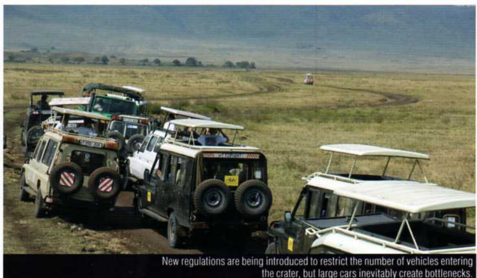
New regulations are being introduced to restrict the number of vehicles entering the crater, but large cars inevitably create bottlenecks.

co-exist in harmony – at least within a self-regulating system where neither man nor wildlife exerts excessive demands on the productive capacity of the natural environment. But as demand on the natural environment increases, so does the potential for conflict between development and conservation needs. Inevitably, the NCAA faces many challenges in its efforts to reconcile these needs. 'There were fewer than 8,000 Maasai living in the area when the NCA was created, but this had doubled by the time