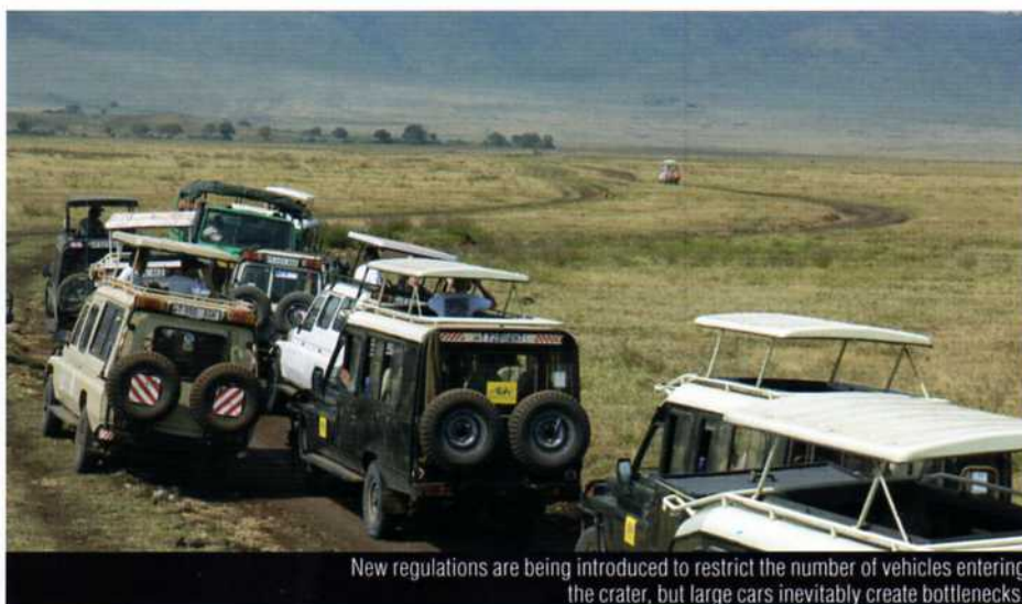
New regulations are being introduced to restrict the number of vehicles entering the crater, but large cars inevitably create bottlenecks.

co-exist in harmony – at least within a self-regulating system where neither man nor wildlife exerts excessive demands on the productive capacity of the natural environment. But as demand on the natural environment increases, so does the potential for conflict between development and conservation needs. Inevitably, the NCAA faces many challenges in its efforts to reconcile these needs. 'There were fewer than 8,000 Maasai living in the area when the NCA was created, but this had doubled by the time